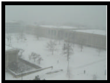
Winters can be disagreeable

For those of you who may not be aware of it the Oswego campus is situated right on the sparkling southern shoreline of Lake Ontario.