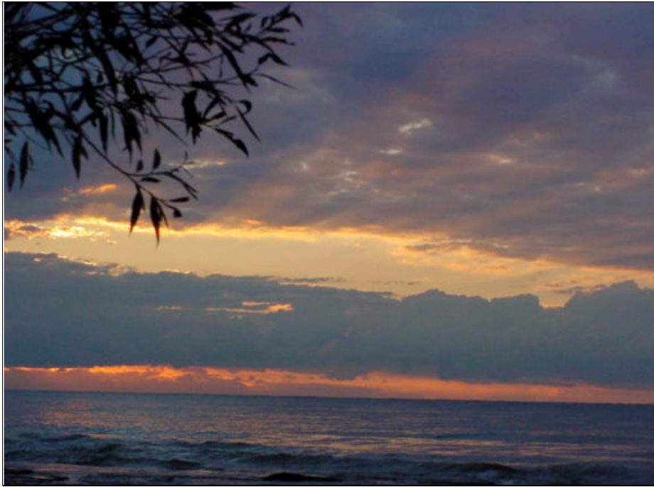
Sunset over Lake Ontario – taken from SUNY Oswego campus